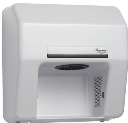
BA101 – White

The Supreme BA101 hand dryer is a heavy duty and economical model. With over 20 years proven reliability in New Zealand environments, the machine's unique drying chamber and air recirculating feature reduce drying time. Suitable for installation over bench tops or reflective surfaces.